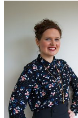
Gladys (Kirsty Elliott)