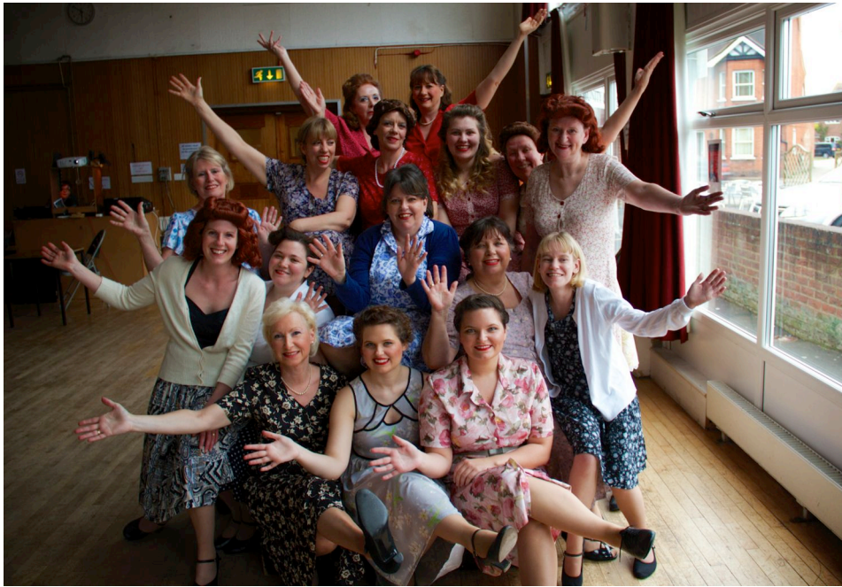
Cast of Keep the Home Fires Burning, April 2014